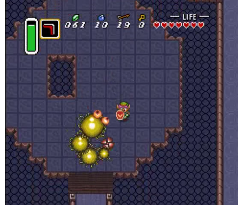
Figure 1: An in-game screen capture of the Moldorm boss from The Legend of Zelda: A Link to the Past . Generating these types of boss encounters is challenging with current techniques due to the complex representation of boss behavior; bosses are defined by programs.

© 2017 Copyright held by the owner/author(s). Publication rights licensed to ACM. 978-1-4503-5319-9/17/08...$15.00 DOI: 10.1145/3102071.3102076